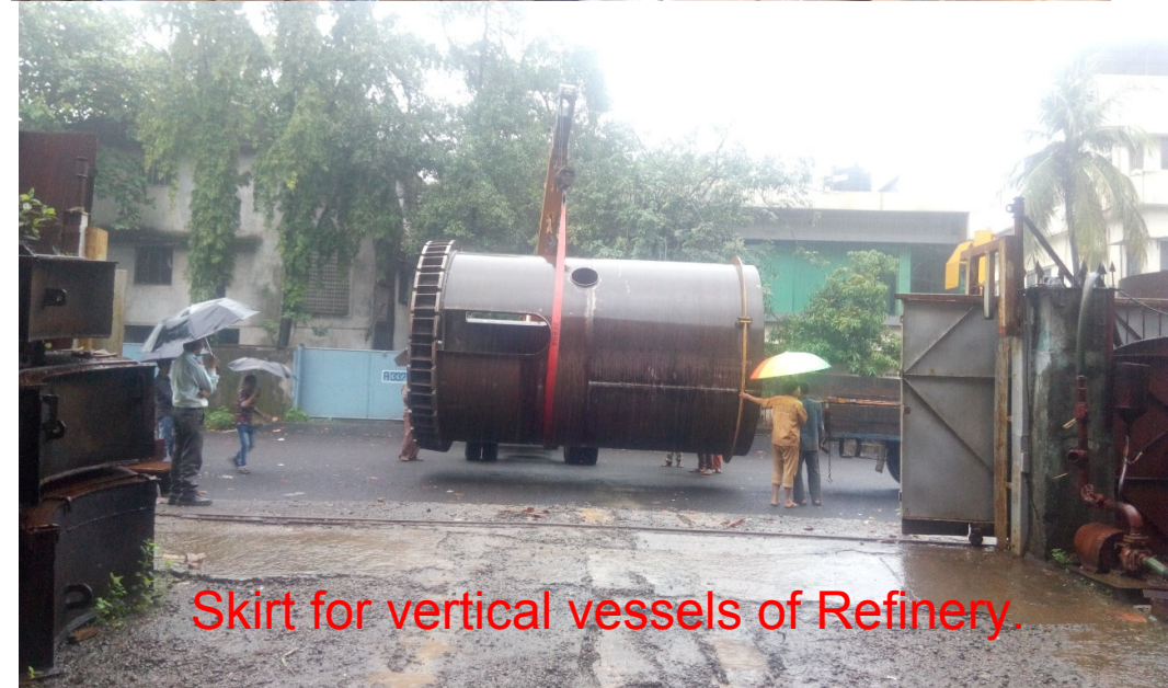
Skirt for vertical vessels of Refinery.