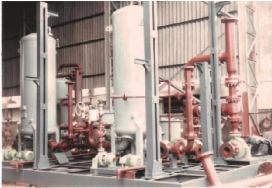
Skid for ION Exchange.