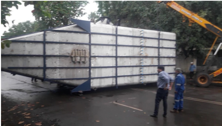
VBC 16X18. Made for Lance Engineering Pvt. Ltd.